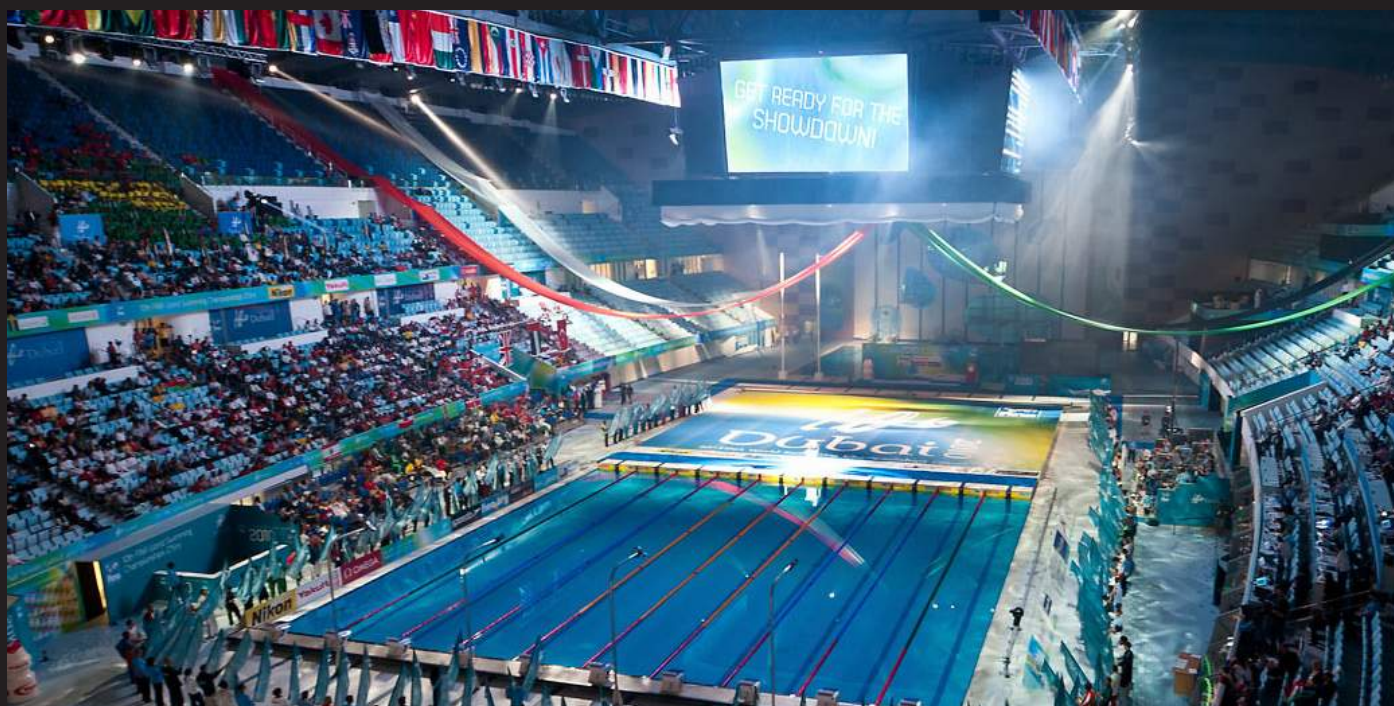
The Hamdan Sports Complex, Dubai