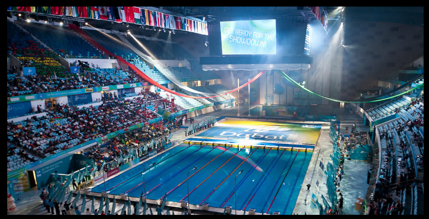
The Hamdan Sports Complex, Dubai