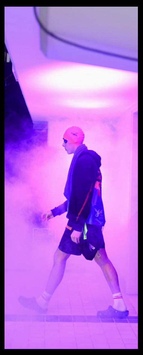
Believe. Sacrifice. Achieve.