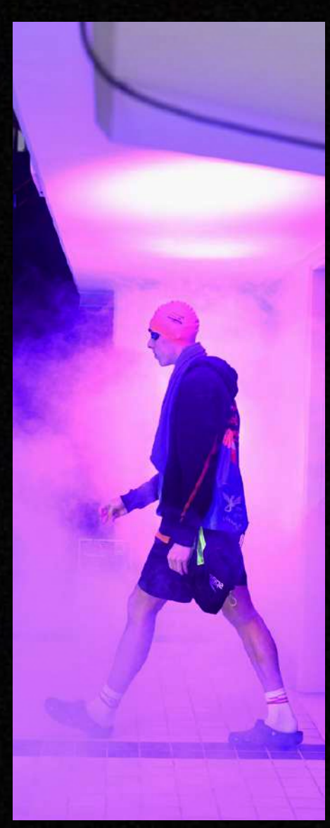
Believe. Sacrifice. Achieve.