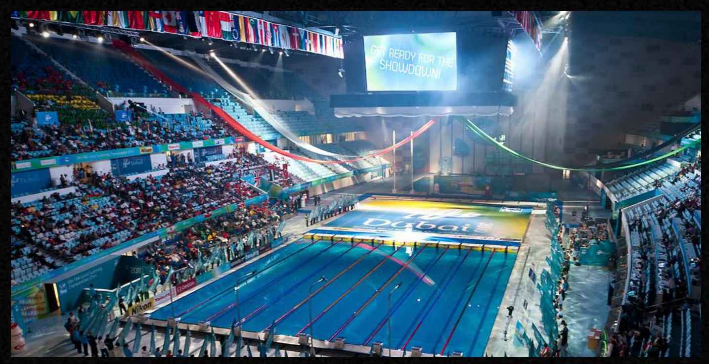
The Hamdan Sports Complex, Dubai