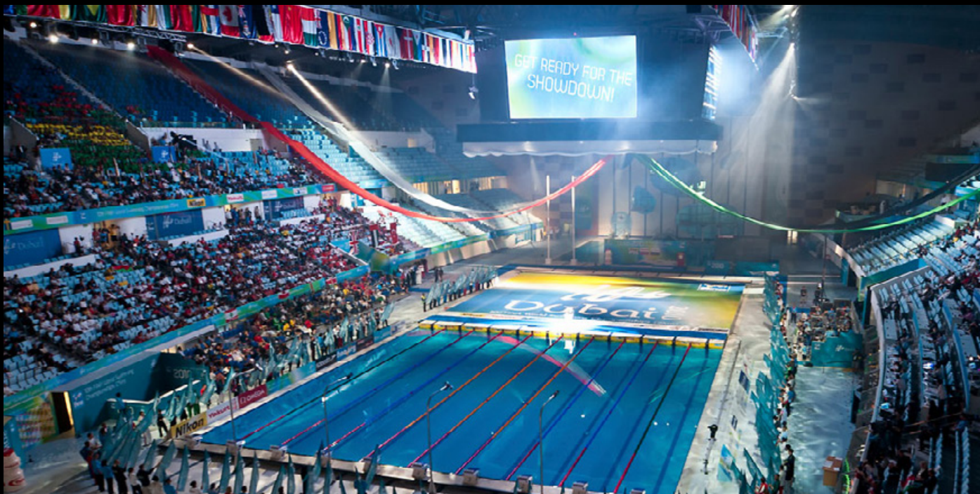
The Hamdan Sports Complex, Dubai